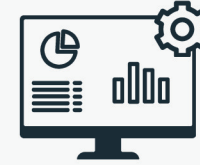
Building management system