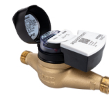
aquabasic® PMK Domestic water meter with aquastream®-communication module